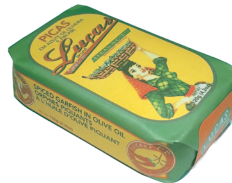
"PICAS" GARFISH IN OLIVE OIL AND PIRI-PIRI EAN13: 5602899300121