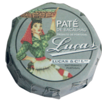
COD PÂTÉ EAN13: 5602899251414