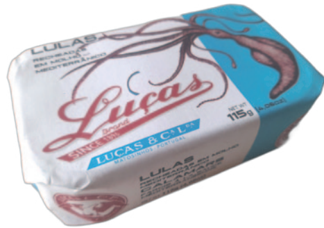
STUFFED SQUID IN MEDITERRANEAN SAUCE EAN13: 5602899231272