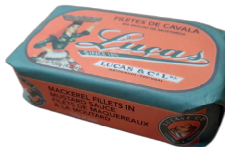
MACKEREL FILLETS IN MUSTARD SAUCE EAN13: 5602899221297