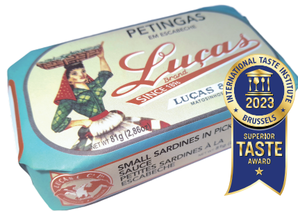
“PETINGAS” SMALL SARDINES IN MARINADE EAN13: 5602899213278