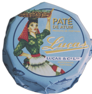
TUNA PÂTÉ EAN13: 5602899251416