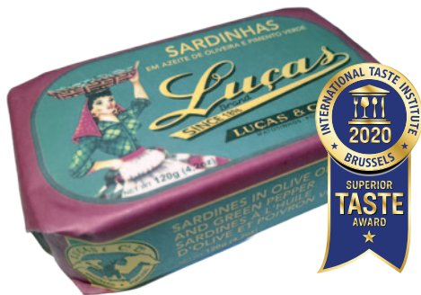
PORTUGUESE SARDINES IN OLIVE OIL AND GREEN PEPPERS