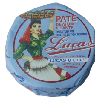
SPICED TUNA PÂTÉ EAN13: 5602899251423