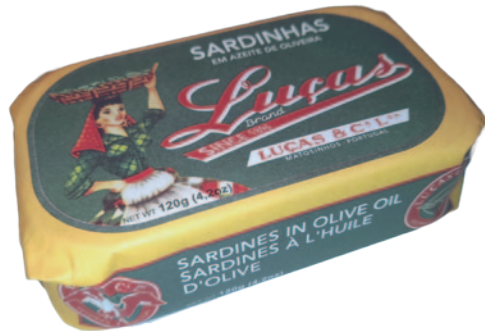
PORTUGUESE SARDINES IN OLIVE OIL