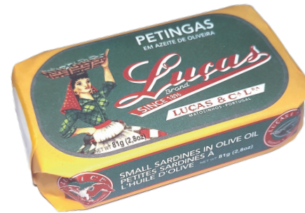
“PETINGAS” SMALL SARDINES IN OLIVE OIL EAN13: 5602899212103