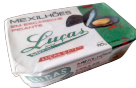
MUSSELS IN SPICED PICKLED SAUCE EAN13: 5602899410721