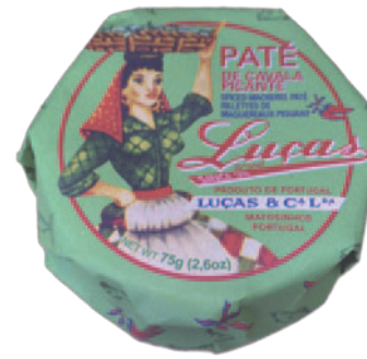
SPICED MACKEREL PÂTÉ EAN13: 5602899221428