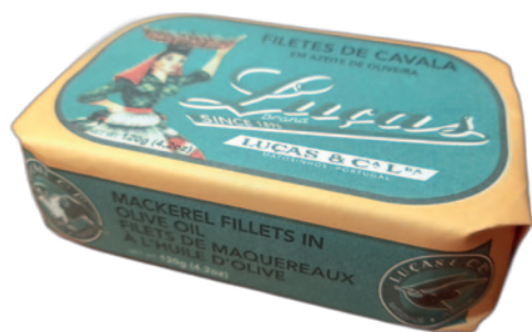
MACKEREL FILLETS IN OLIVE OIL EAN13: 5602899221105