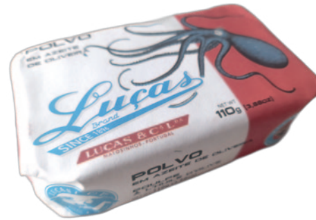
OCTOPUS IN OLIVE OIL EAN13: 5602899241103