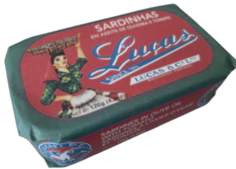
PORTUGUESE SARDINES IN OLIVE OIL WITH TOMATO EAN13: 5602899211113