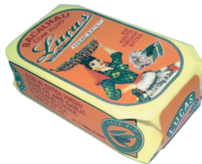
COD IN OLIVE OIL AND GARLIC EAN13: 5602899271100