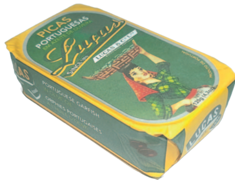
"PICAS" GARFISH IN OLIVE OIL EAN13: 5602899300107