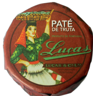
TROUT PÂTÉ EAN13: 5602899281413