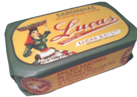
PORTUGUESE SARDINES IN OLIVE OIL AND PIRI-PIRI