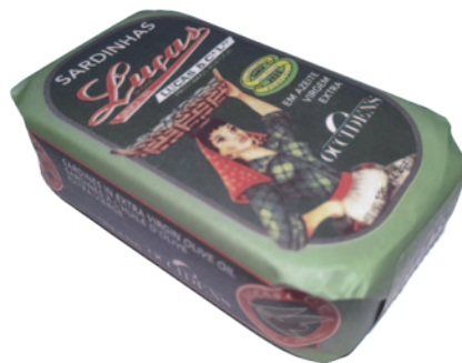
PORTUGUESE SARDINES “MILLÉSIME 2020” IN EXTRA VIRGIN OLIVE OIL “OCCIDENS” EAN13: 5602899211502