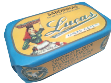
PORTUGUESE SARDINES IN OLIVE OIL AND LEMON