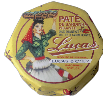
SPICED SARDINE PÂTÉ EAN13: 5602899211427