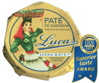
SARDINE PÂTÉ EAN13: 5602899211410