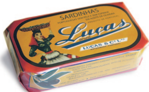
SKINLESS AND BONELESS PORTUGUESE SARDINES IN OLIVE OIL