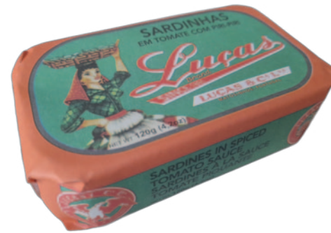
PORTUGUESE SARDINES IN SPICED TOMATO SAUCE EAN13: 5602899211236