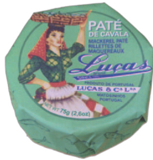
MACKEREL PÂTÉ EAN13: 5602899221419