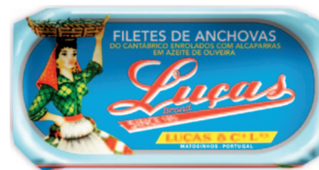
CANTABRIAN ANCHOVY FILLETS WRAPPED WITH CAPERS IN OLIVE OIL