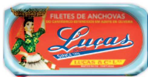
CANTABRIAN ANCHOVY FILLETS EXTENDED IN OLIVE OIL