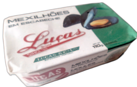
MUSSELS IN PICKLED SAUCE EAN13: 5602899410707