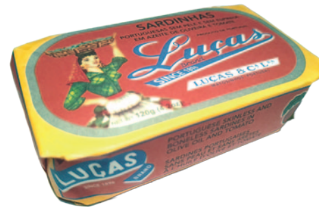
SKINLESS AND BONELESS PORTUGUESE SARDINES IN OLIVE OIL AND TOMATO