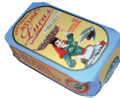
TUNA BELLY IN OLIVE OIL EAN13: 5602899251195