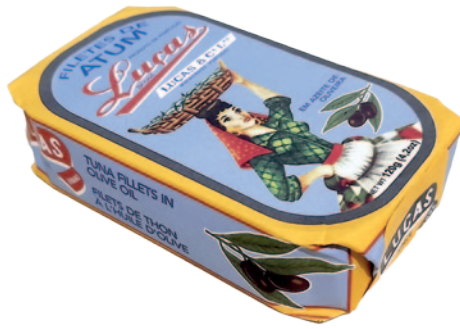
TUNA FILLETS IN OLIVE OIL EAN13: 5602899251188